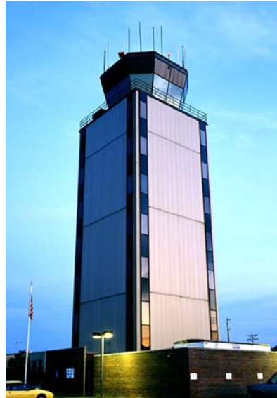
Spirit Airport Control Tower Today Built in 1984