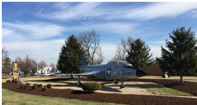
VOODOO AT SPIRIT AIRPORT 03/02/2018

First flight: September 29, 1954 (F-101A) Power: Two Pratt & Whitney 6749kg/14,880 lb after burning thrust J57-P-55 turbojet engines Armament: Two MB-1 Genie nuclear-tipped air-to-air missiles and four Falcon air-to-air missiles or six Falcon air-to-air missiles Size: Wingspan 12.09/39ft 8in Length—20.54m/67 ft 4.75 in Height—5.49m/18ft Wing area—34.19m 2 /368 sq ft Weights: Empty—13,141kg/28,970 lb Maximum take-off—23,768kg/52,400 lb Performance: Maximum speed 1,965 kph/1,221 mph Ceiling 16,705m/54,800 ft Range 2,494km/1,550 miles Climb 11,133m/36,500 ft per minute